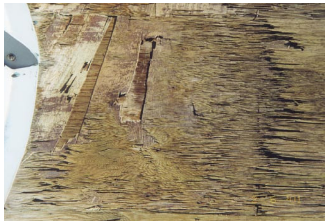
This plywood fan deck has rotted away making it dangerous for workers to walk on.

For more EXTREN® design information, visit www.strongwell.com/designmanual for the online Strongwell Design Manual!