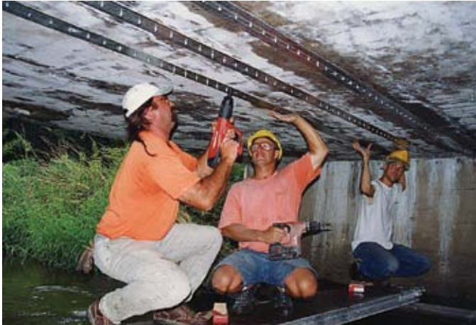
Workers installed SAFSTRIP® on this bridge in Edgerton, Wisconsin, using the MF-FRP system. The load rating for the bridge increased from HS-17 to HS-25 as a result.