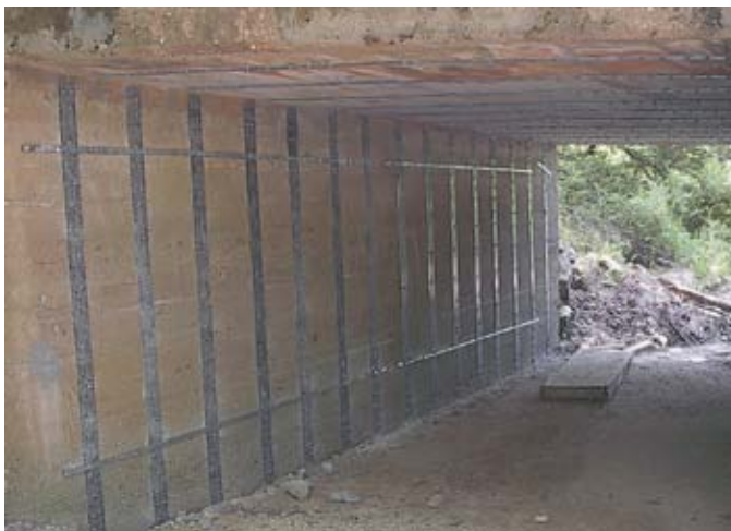
The abutment and deck of this bridge in Phelps County, Missouri, was strengthened using SAFSTRIP®.