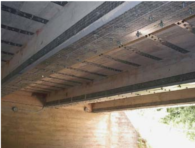
The posted load for this bridge that spans the Meramec River in Missouri was increased from 10 tons to 18 tons by installing SAFSTRIP® using the MF-FRP system.